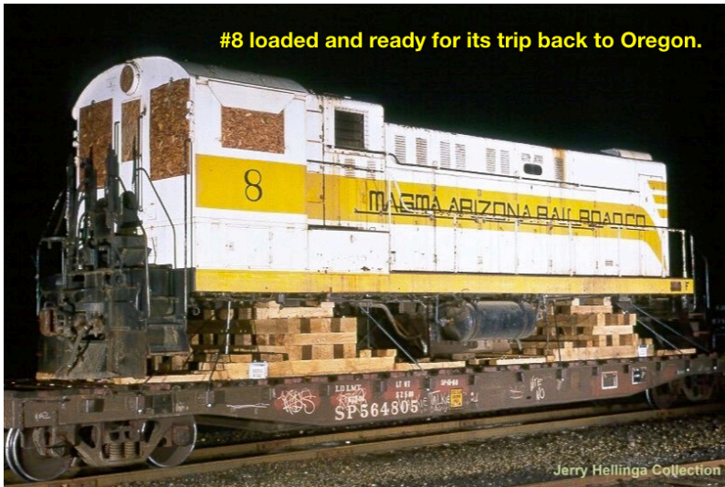
#8 loaded and ready for its trip back to Oregon.