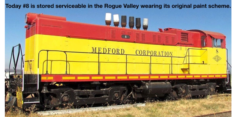
Today #8 is stored serviceable in the Rogue Valley wearing its original paint scheme.