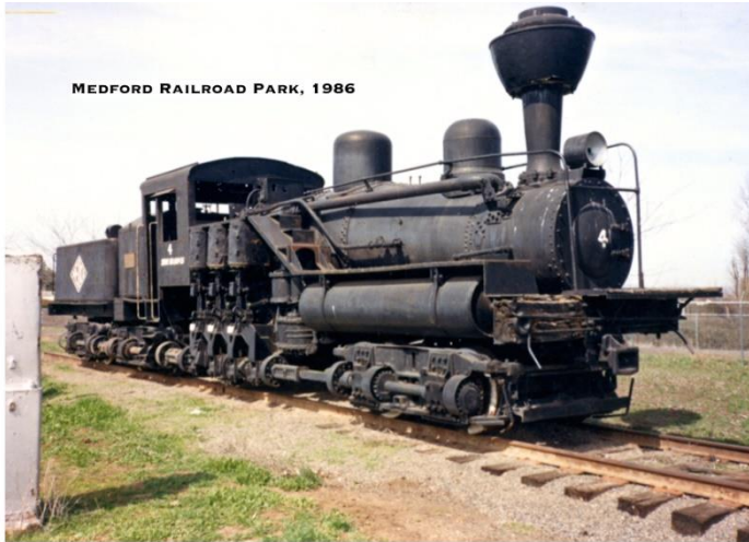
MEDFORD RAILROAD PARK, 1986

In September, 1997 the Society acquired the No. 4 for $1.00 from the City of Medford with the intent of restoring it to operating condition. During the time that the locomotive sat unprotected in Jackson Park most of the smaller, removable, and collectable parts were removed by collectors and vandals.