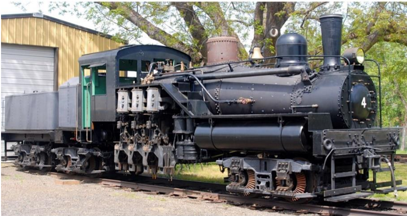
Number 4 as it appears today at Medford Railroad Park. The locomotive is about 90% complete in its restoration to operational condition.

In September, 1997 the Society acquired the No. 4 for $1.00 from the City of Medford with the intent of restoring it to operating condition. During the time that the locomotive sat unprotected in Jackson Park most of the smaller, removable, and collectable parts were removed by collectors and vandals.