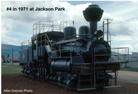
#4 in 1971 at Jackson Park