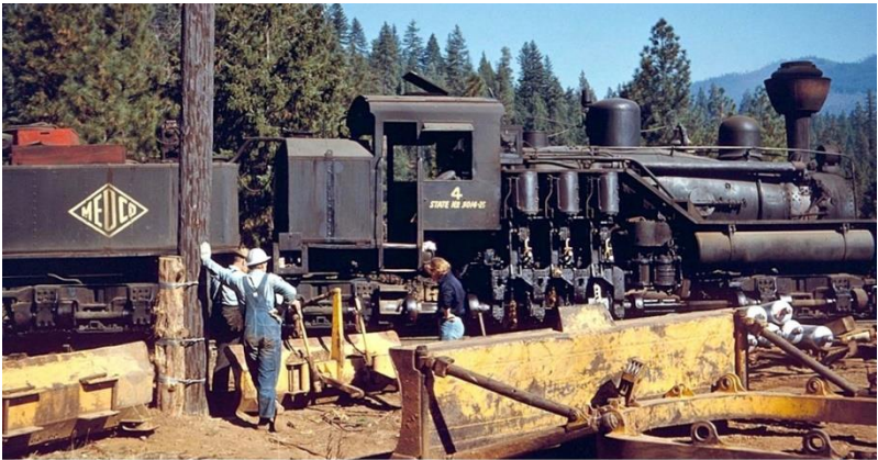
Number 4 at camp 4.