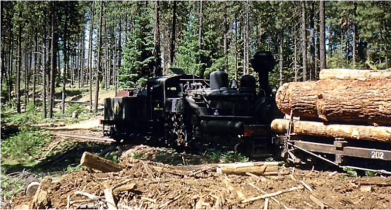
Number 4 hauling loads of logs.