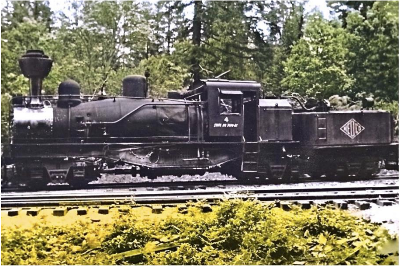
A more uncommon photo of the fireman's side of the locomotive. Photographed in 1959 below Butte Falls before its final trip to Medford. SOHS #4749