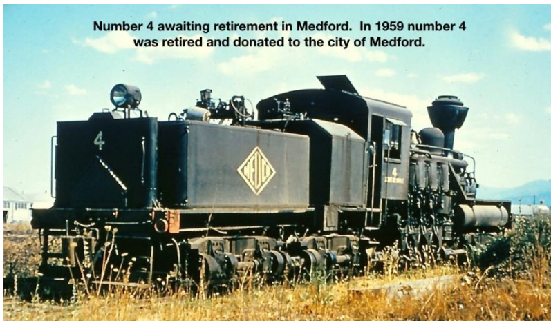
Number 4 awaiting retirement in Medford. In 1959 number 4 was retired and donated to the city of Medford.