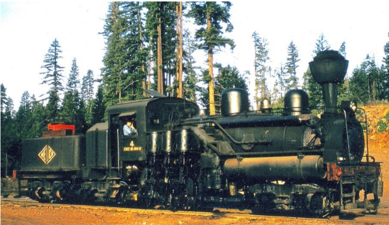
Number 4 taking a break from working in the woods.