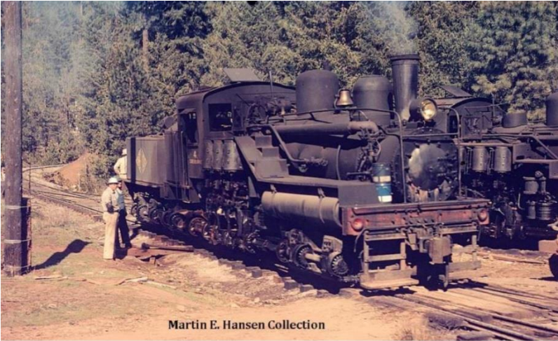
Number 4 at camp 4 with a second locomotive, note the spark arrestor is not on the locomotive.