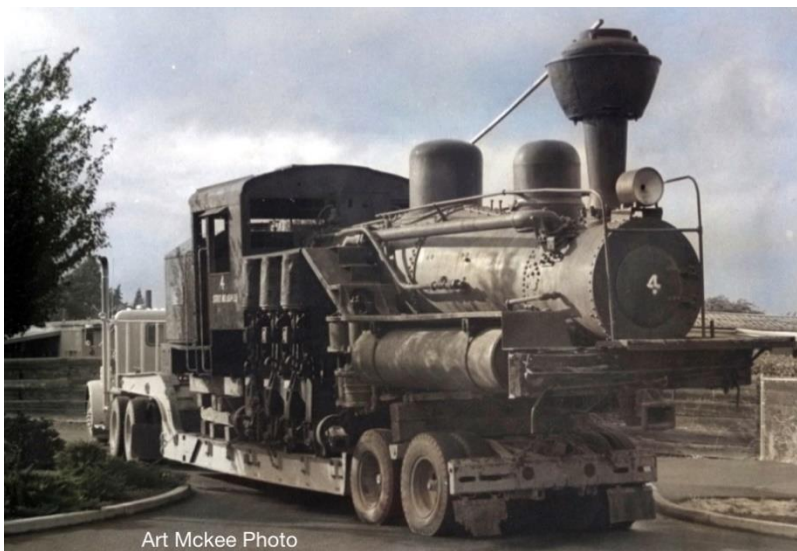
Medco number 4 being moved to Railroad Park in 1986. Shown here in the Railroad Park parking lot.