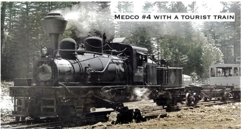
The last run of number 4 before retirement.