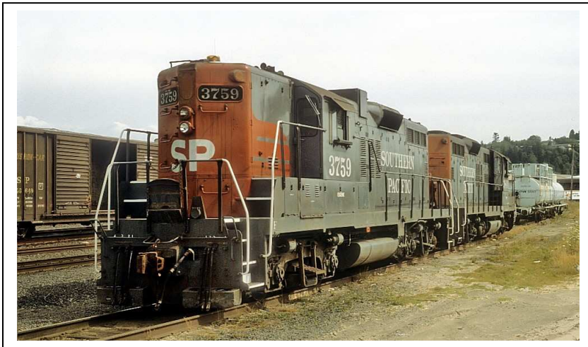
A pair of GP-9e's idling at Coos Bay yard, August, 1990.